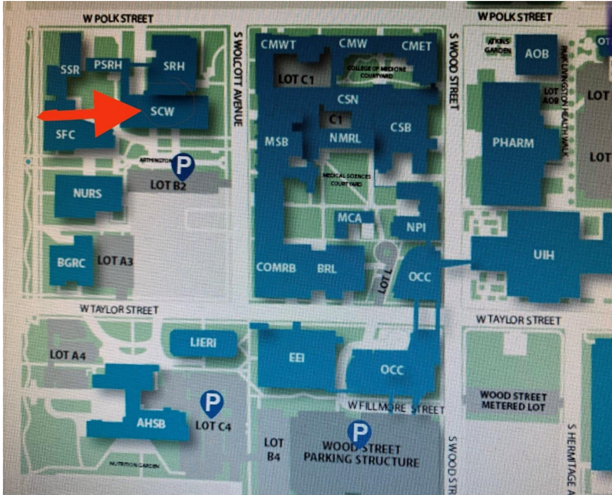
P: Visitor parking map